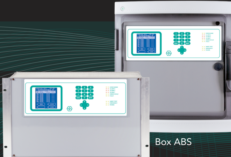
RACK version 19" M